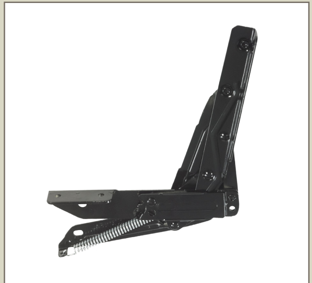
5001 3-position hinge for a bankbed with thicker mattresses or a bankbed with movable armrests ("ears").