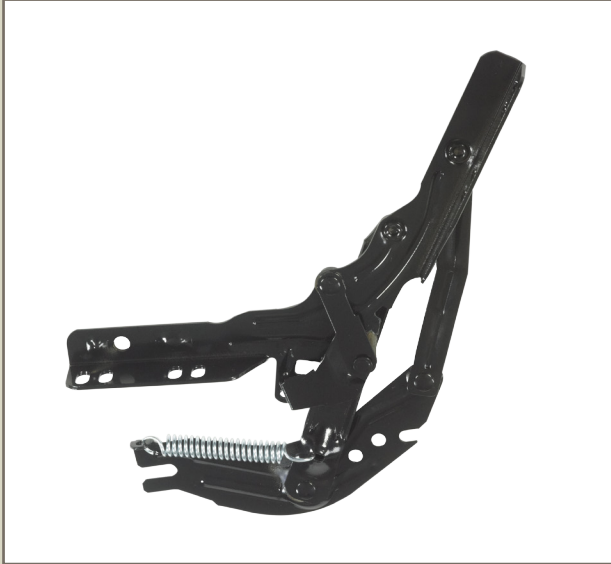
NSM Sedac-Meral's 3-position hinge with a fix, relax and (horizontal) bed position.