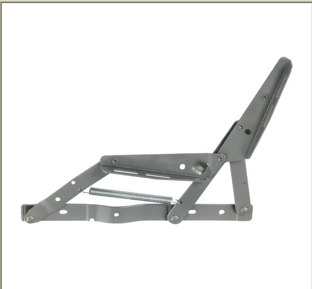
2000 2-position hinge, operated from the back with a sofa and bed position.